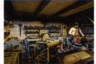
View from Inside the Ark Encounter