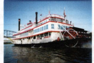
Enjoy a BB Riverboats Sightseeing Cruise