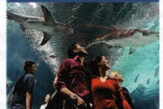
Incredible Creatures at Newport Aquarium