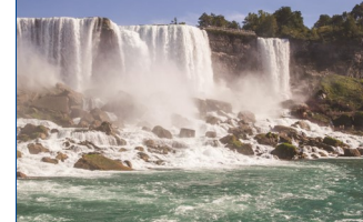
Experience a Majestic View of the Falls