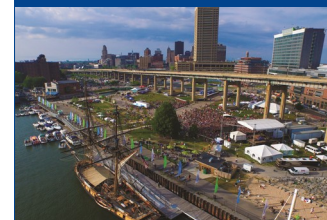
Visit to Buffalo's Canalside