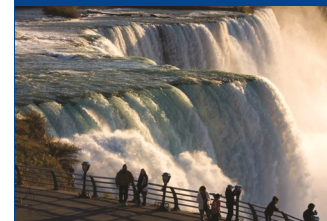
World's most famous Falls